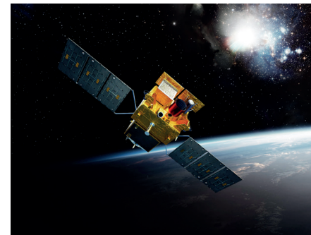
The SVOM gamma-ray burst observatory